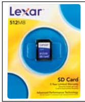
Image Storage 512Mb: 6M (2816x2112 pixels) S.FINE 154 exp FINE 297 exp 5M (2592x1944 pixels) S.FINE 184 exp FINE 351 exp MOVIE (640x480) 15fps 1hr 6m, 30fps 34min

Image Storage 1Gb: 6M (2816x2122 pixels) S.FINE 309 exp FINE 594 exp 5M (2592x1944 pixels) S.FINE 369 exp FINE 701 exp MOVIE (640x480) 15 fps 2hr 12m, 30 fps 1hr 9m