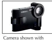
Camera shown with cradle mount