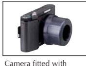
Camera fitted with lens mount