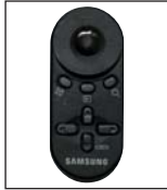
SRC-A3 Infra-red Code: 50112