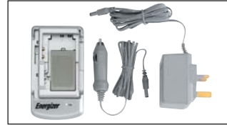
Includes mains and 12v DC in-car charger and carrier for battery. Code: 50109