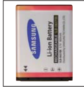
SLB-0837(B) 3.7V 800mAh. Code: 50113