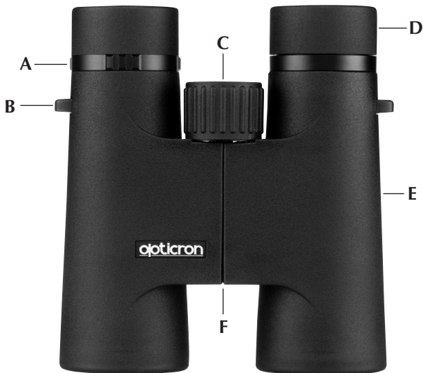
Model featured: Black