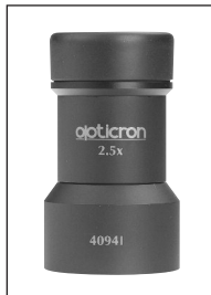
40940 2.5x Universal Tele-Adapter (UTA) with 40941 connection ring

The Opticron UTA enables you to increase the magnification of your Aurora BGA binocular by a factor of 2.5x using a simple push fit connection. Features include: 'B' specification eyepiece for use with or without spectacles, twist type eyecup assembly and fully multi-coated optics.