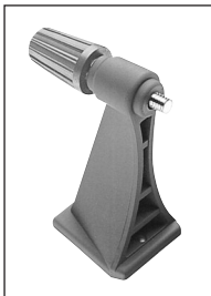
31012 Binocular Tripod Mount BGA roof prism models