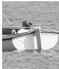
8x Binocular with 2.5x UTA giving 20x magnification